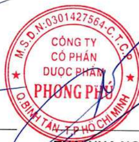
THAI NHA NGON General Director